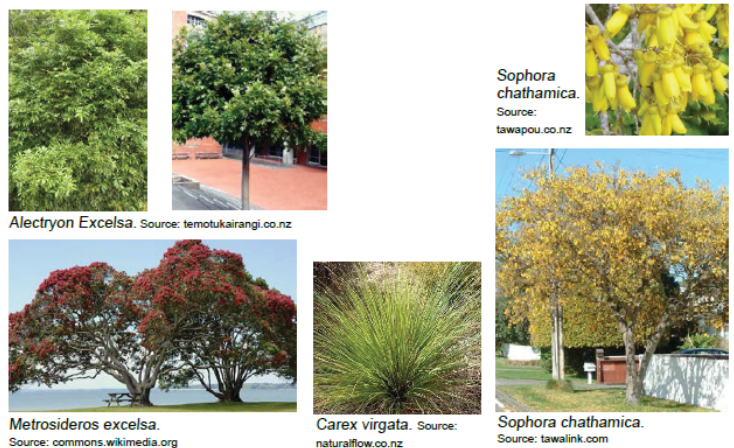
Figure 17 - Planting Guide - Key Local Road - Stage 1 and 2